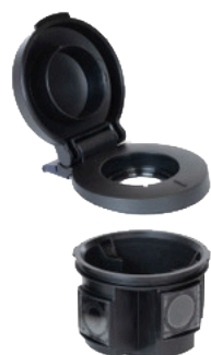
Replaceable Optics Kit PT128